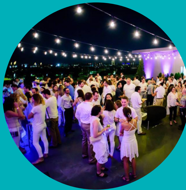
Tu B'Av white party in Israel

All over Israel, festivals of singing and dancing bust out on the night of Tu B'Av, and the entertainment and beauty industries work overtime to create the right vibes for lovers hoping to get flirty. Tu B'Av is slowly creeping into the Jewish diaspora, and Honeymoon Israel wants to help bring it into the spotlight. We'll take any excuse to celebrate love!