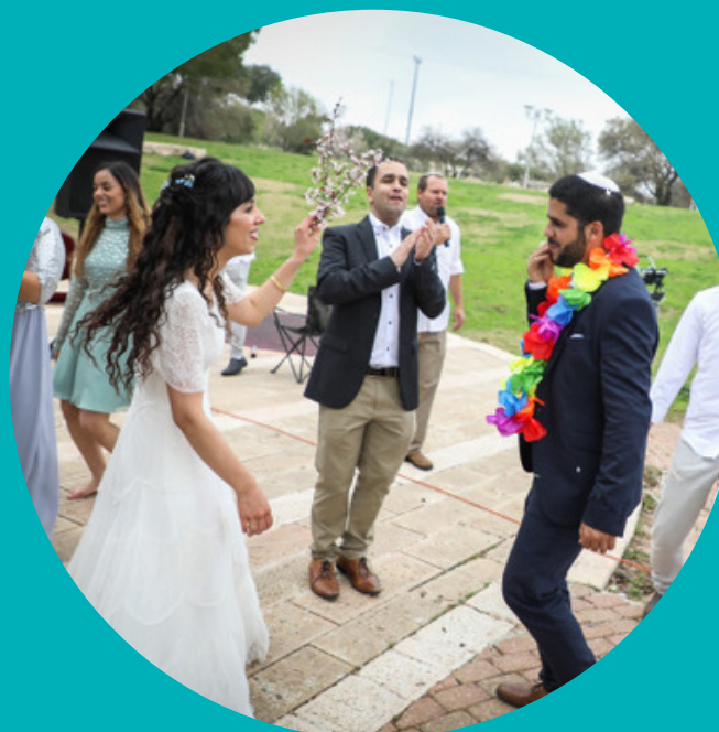
Getting hitched on Tu B'Av