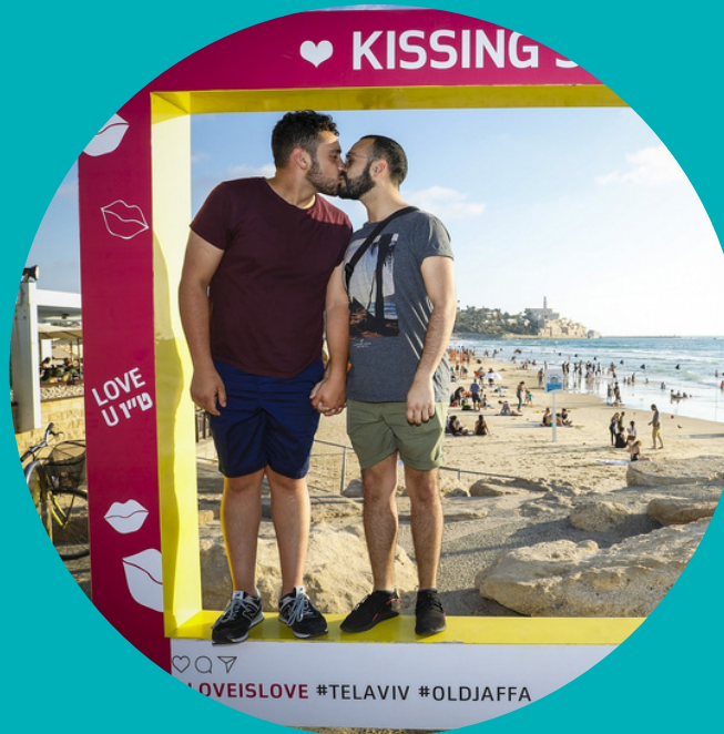
Tu B'Av smooch on the beach at Tel Aviv